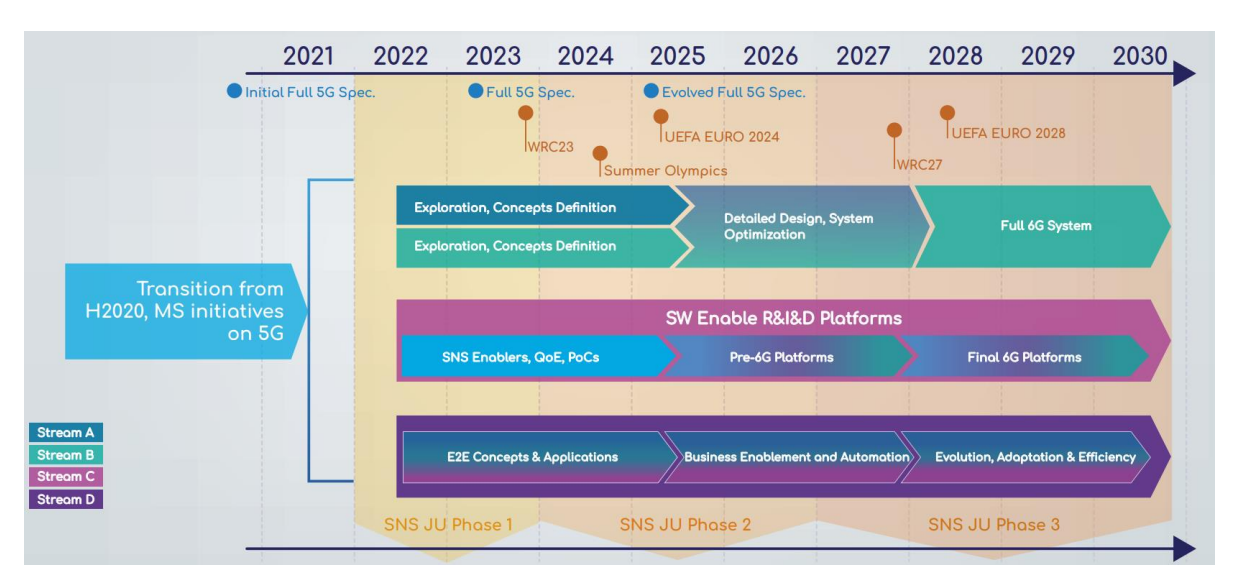
Figure 1: SNS Roadmap

The updated SNS roadmap (Figure 1) illustrates the phases of the streams.