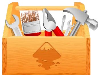
Toolbox for proposers