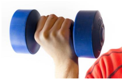
Trainings, Seminars & Webinars