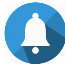
Personalised weekly notification