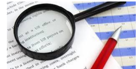
Full proposal check & Project idea check